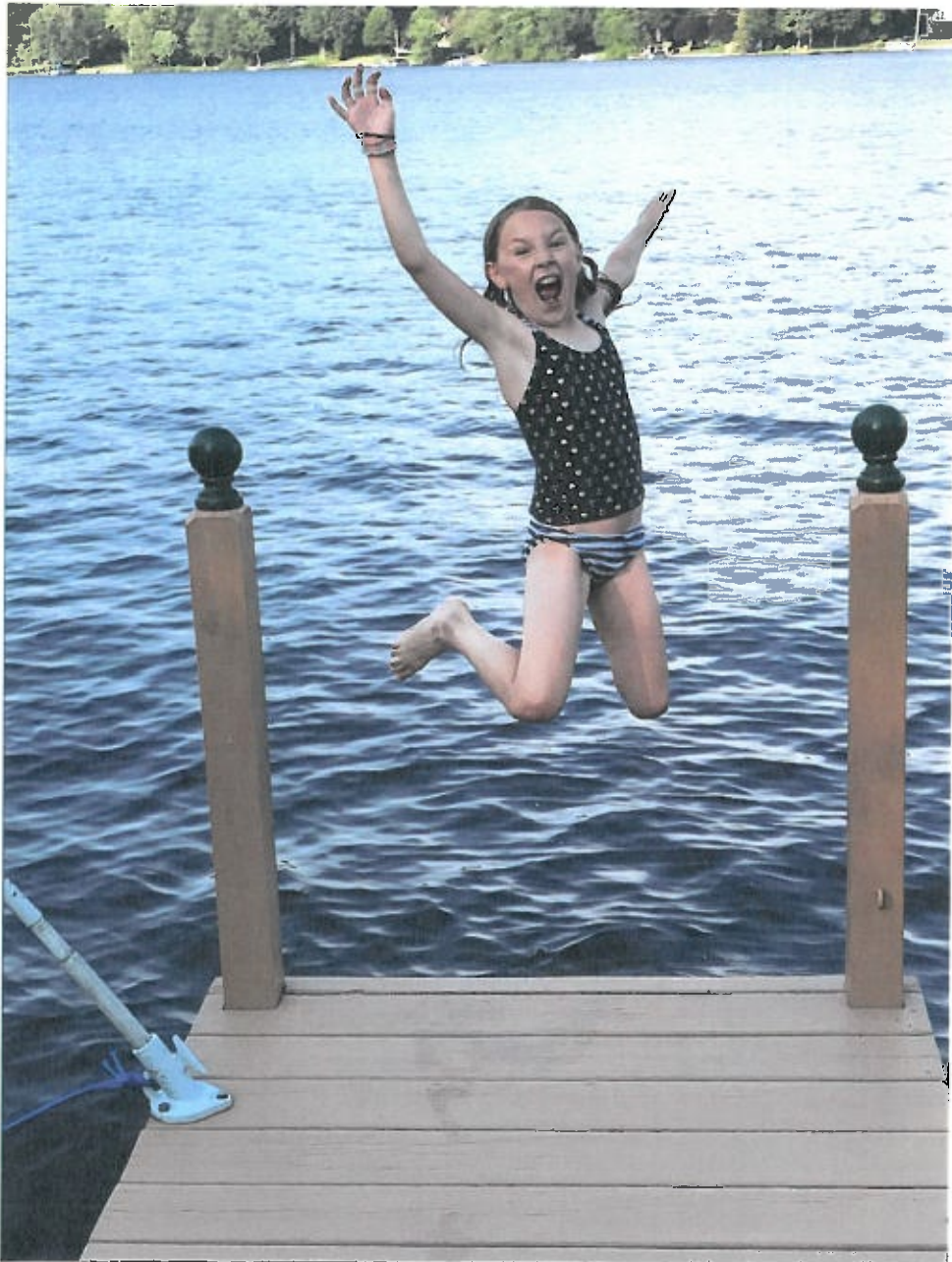
Best Photo of having fun on the lake in 2017/2018: St. Pierre - Mid-air Jumper