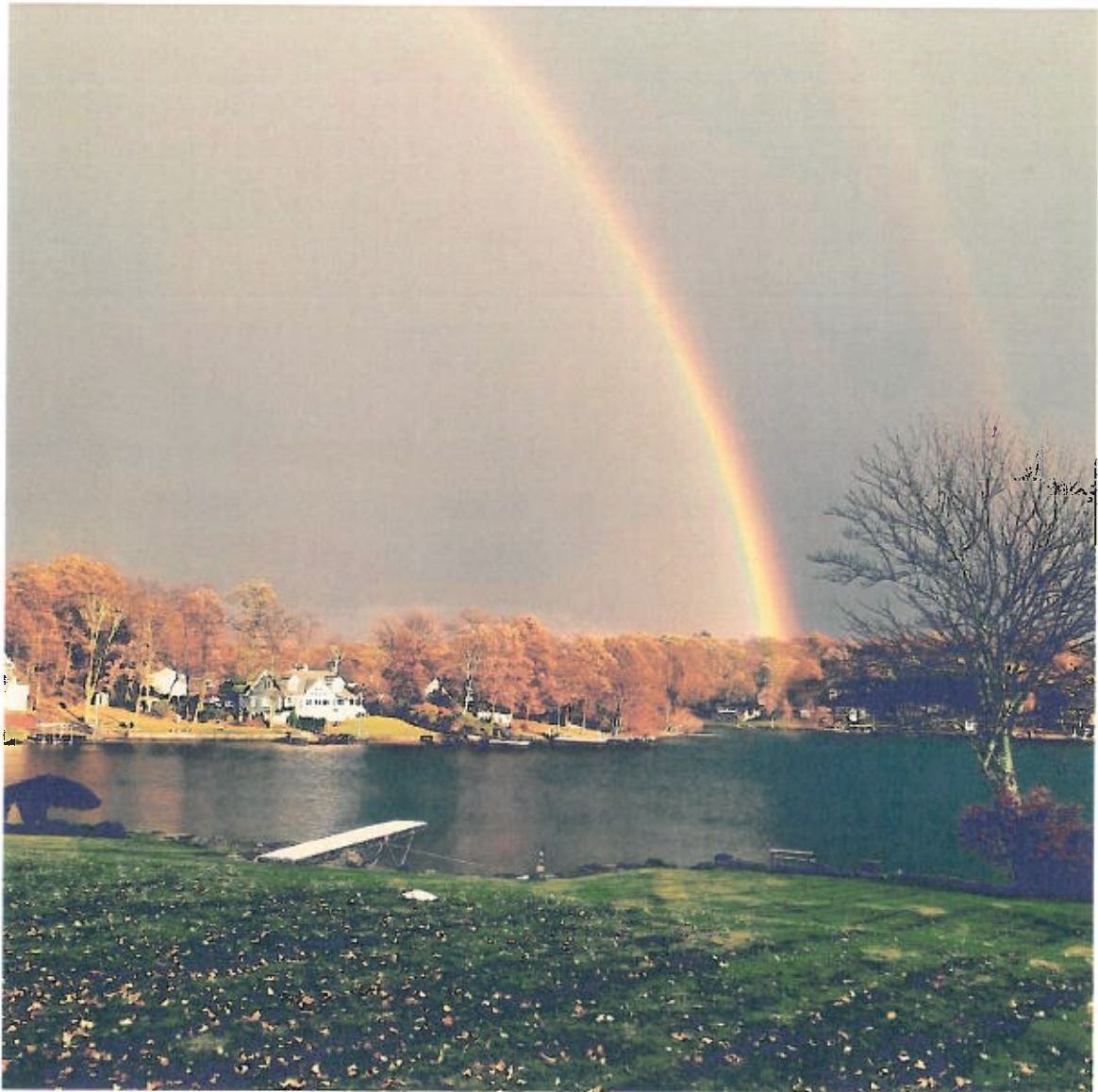
Best Sunrise shot on the lake in 2017/2018: Watson - Sunrise Rainbow