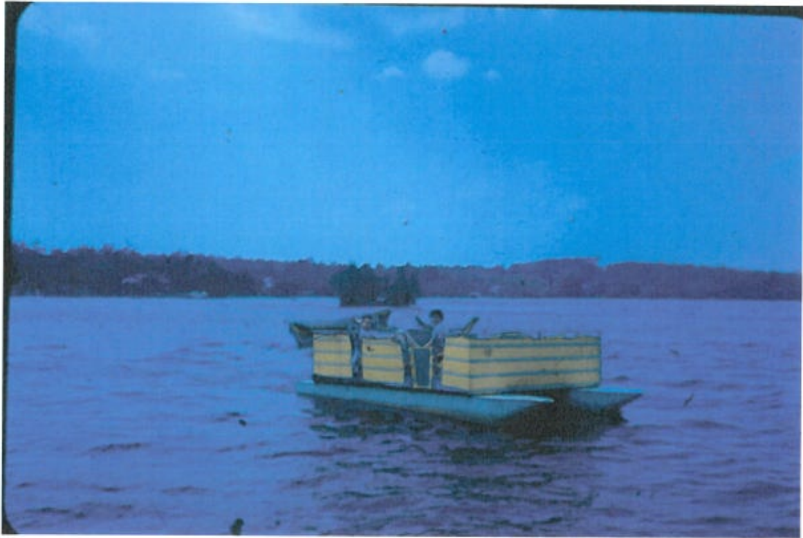
Best Never-Before-Seen photo of Cedar Lake prior to 1990: Klammer - Vintage Pontoon Boat - 1961