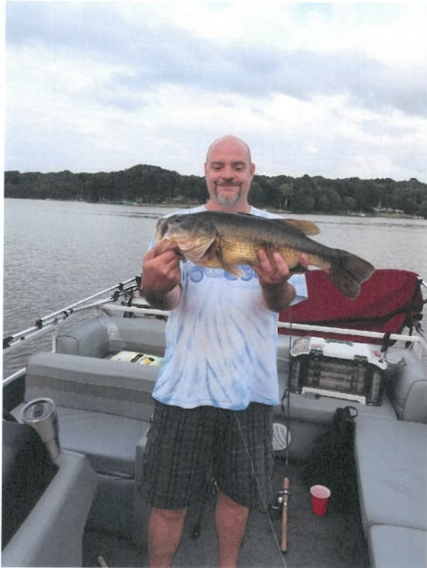
Best Nature shot on the lake in 2017/2018: Krystock- BIG Bass